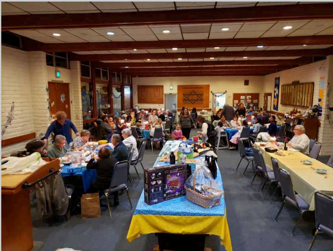
A photo from the Temple Beth El Hanukkah party on December 29, 2019