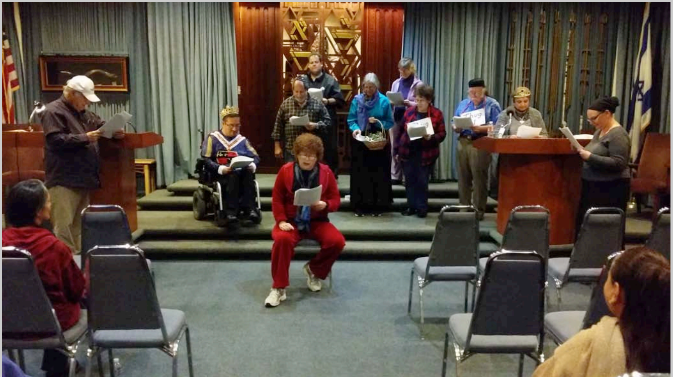
The Purim Spiel at TBE (February 23rd, 2018)